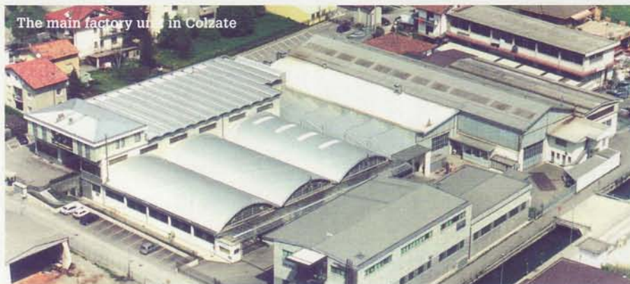
The main factory unit in Colzate

Sometimes there is a requirement for Texpan's expertise in manufacturing components for the Siempelkamp group as a whole, which is involved in a variety of