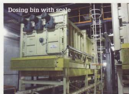
Dosing bin with scale

"We have two such projects that require long forming lines specifically to allow for more forming heads. One is in western Europe and the other in the east," said Mr Gattesco. "Currently, the customer is still